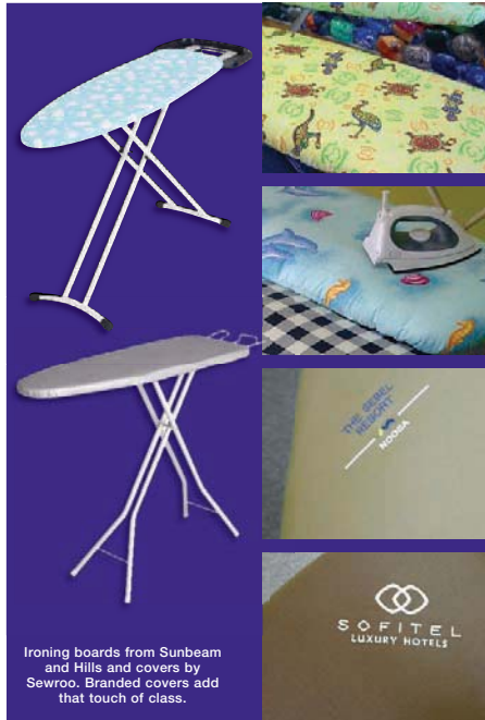
Ironing boards from Sunbeam and Hills and covers by Sewroo. Branded covers add that touch of class.